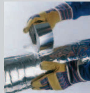
Fixation of pipe insulation

... more interesting products from KORFF