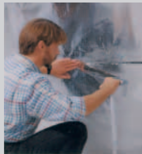
Joint bonding of the TECHNONORM vapour barrier

Aluminum self-adhesive tape with excellent adhesion to metallic or condensate-carrying surfaces. Can be processed at frost and temperatures down to -25 °C.