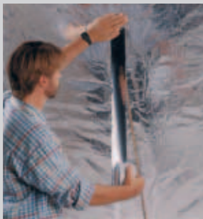
Joint bonding of aluminium-laminated panels